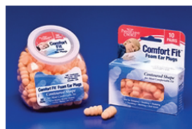
Ear plug protection from Santa Barbara Medco.

With products available at many pharmacy chains, one of Santa Barbara Medco's products was selling at a rate of 20,000 boxes per month at Walgreens stores.