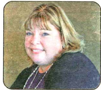
Handi Medical honored — Page 7

MINNESOTA'S DISABILITY COMMUNITY NEWS SOURCE