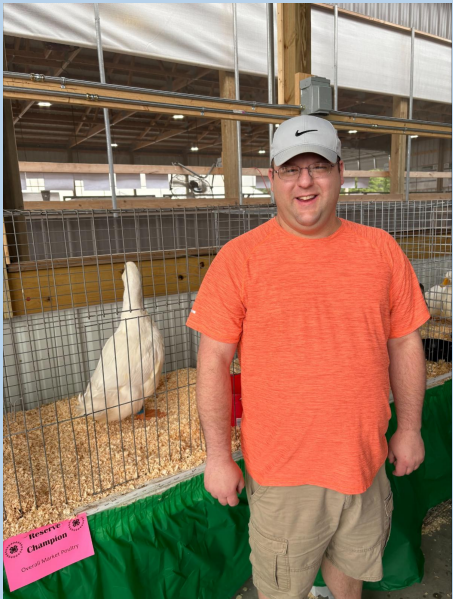
Goodhue County Fair