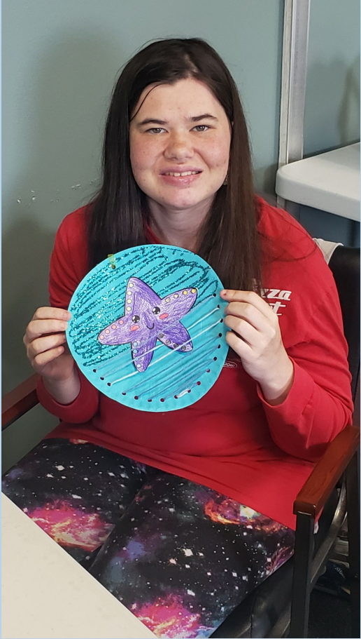
Paper Plate Art