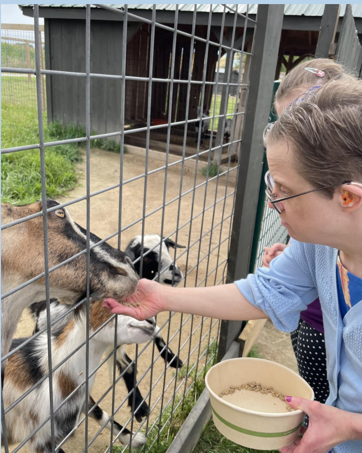
Hungry Goats in Baldwin