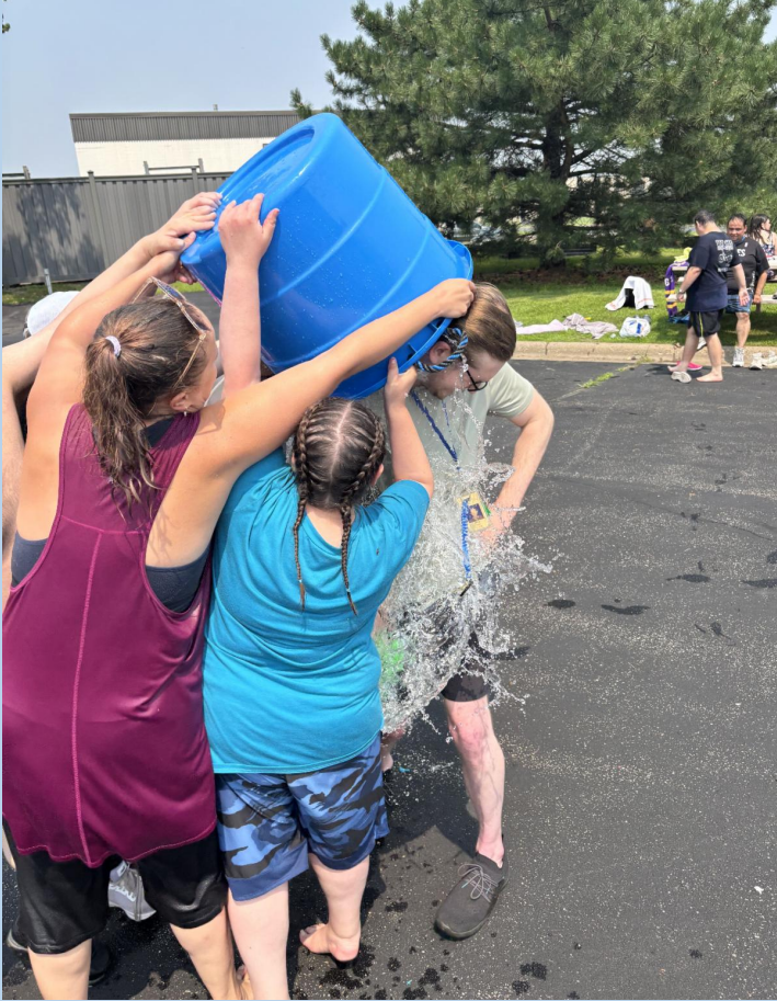
Water Fun Day