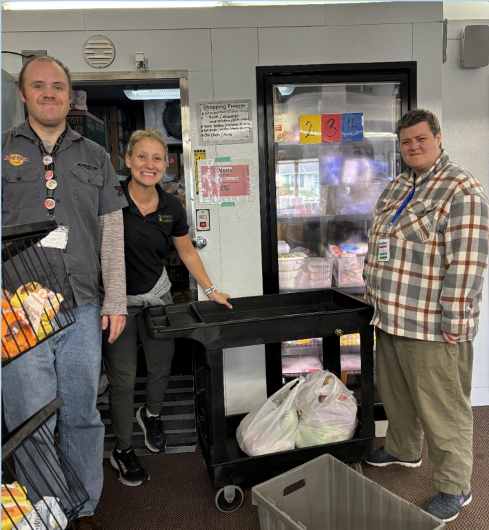
Food Shelf Volunteering