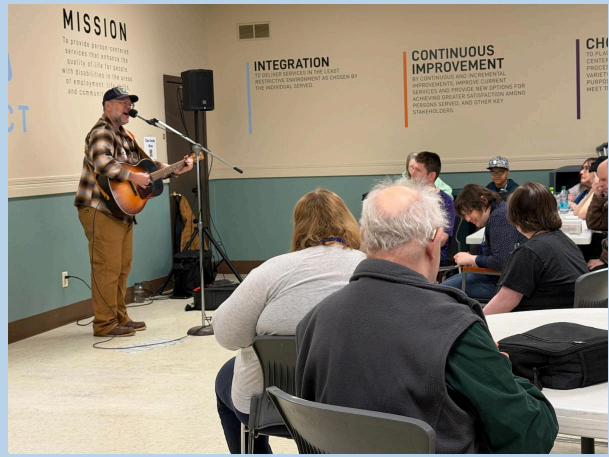
Universal Music Center Time