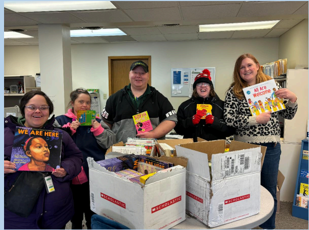
Volunteering with the United Way