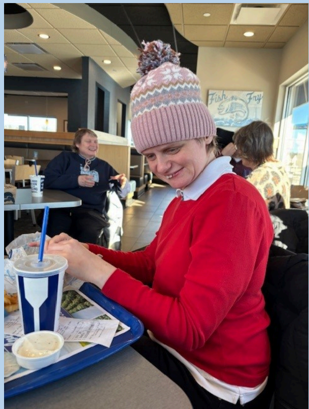
Stopping for Culvers