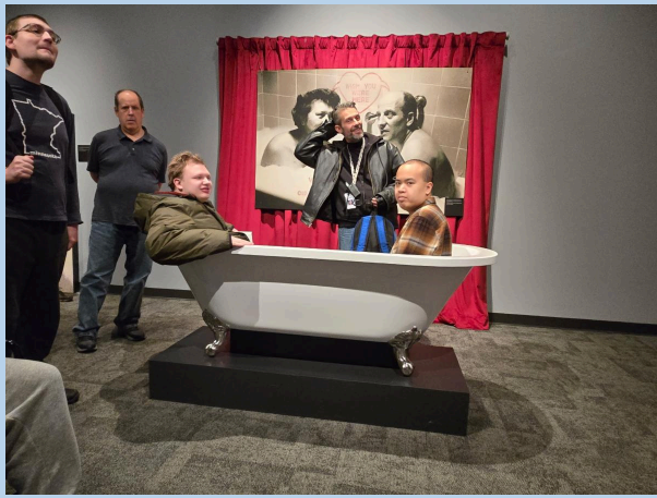
History Center's Julia Child Exhibit