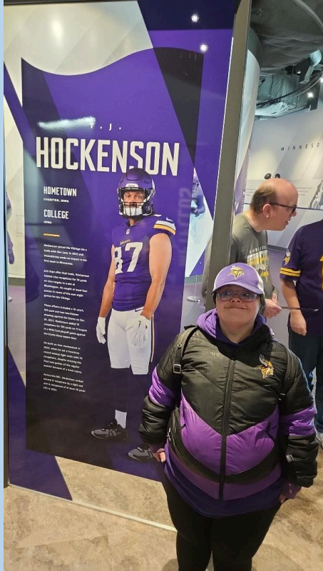
Viking Museum Exploration