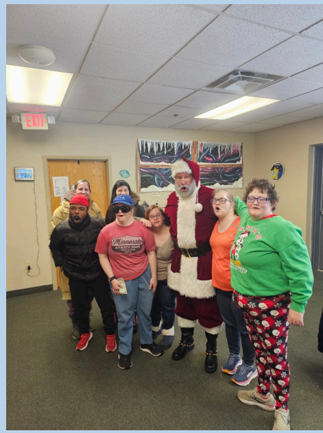
Posing with Santa in Eagan