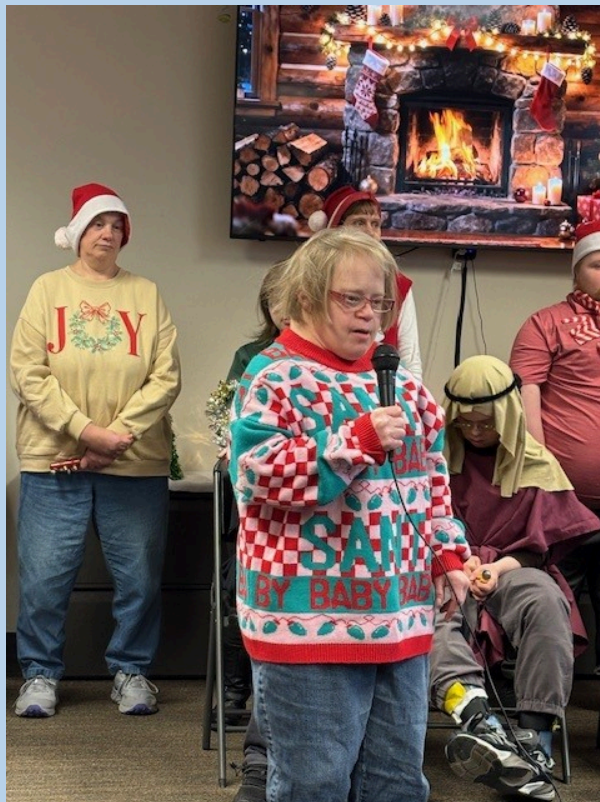
Holiday Program Performance