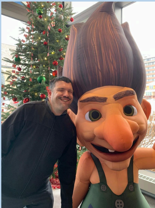
Posing For Photos At Norway House