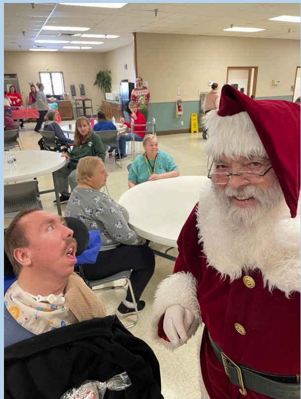
Seeing Santa In Red Wing