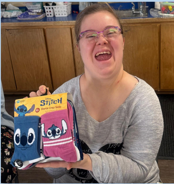
Annual Gift Giving