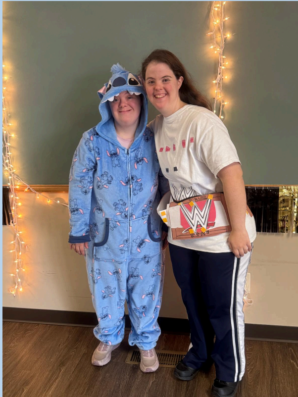
Ohana Meets WWE