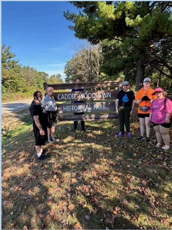
Stretching Our Legs In Caddie Woodlawn