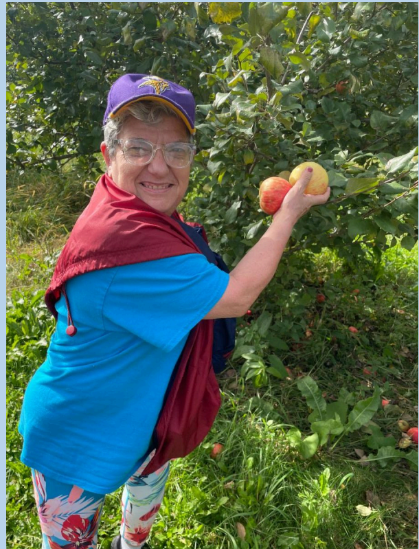
Apple Orchard Adventure