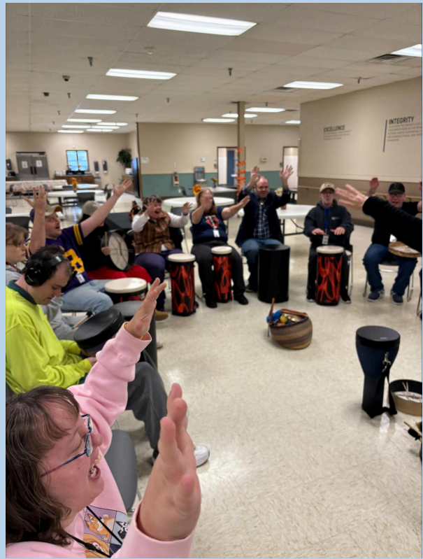
Drum Circle At The Ready