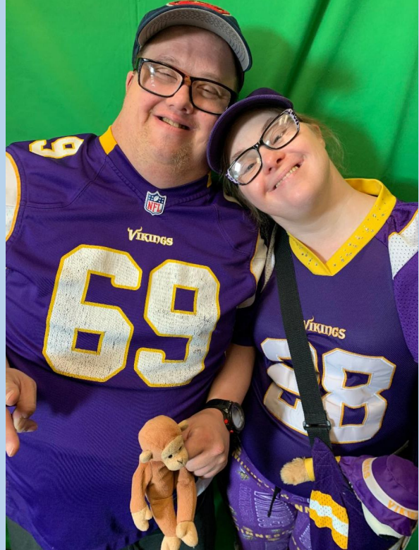
Viking Team Spirit