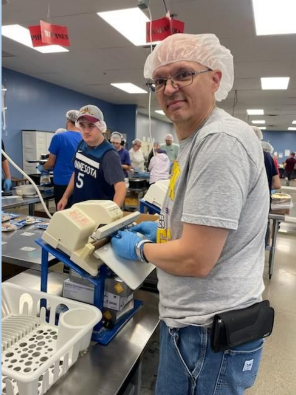
Volunteering at Feed My Starving Children