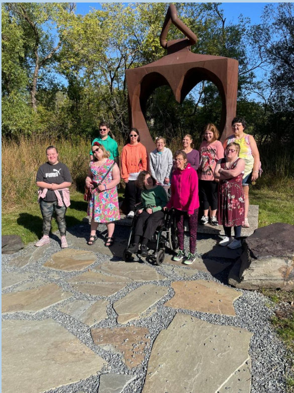
Normandale Japanese Garden