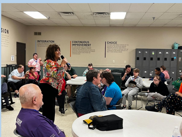
Musical Visit From Universal Music Center