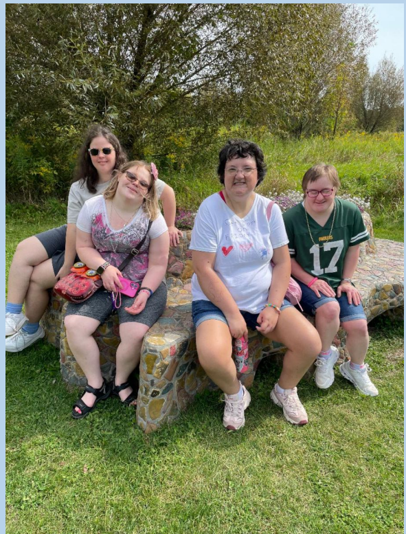
Franconia Art Park