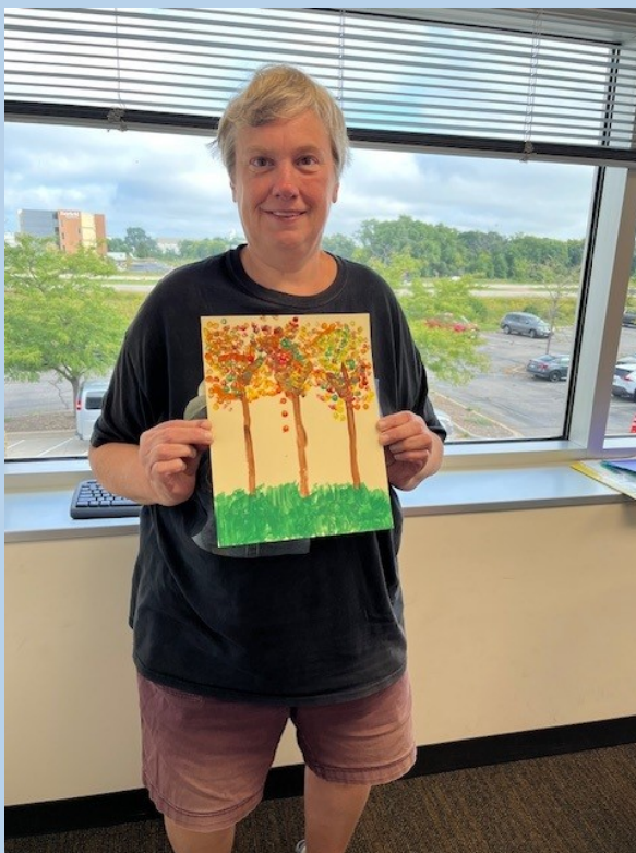
Apple Orchard Painting