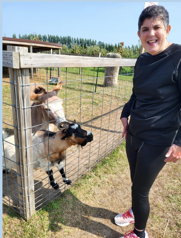
Spending Time With Animal Friends